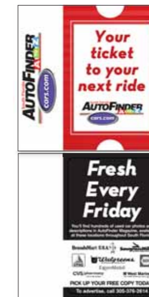
SAMPLE: 3" x 3", DIE-CUT, 2 Colors

SAMPLE: 3" x 3", 80# Coupon, perforated, two-sided, 4 Colors/1 Color